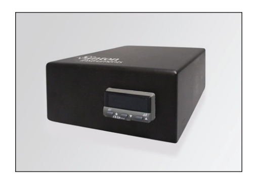
WCT-120TS temperature control box.