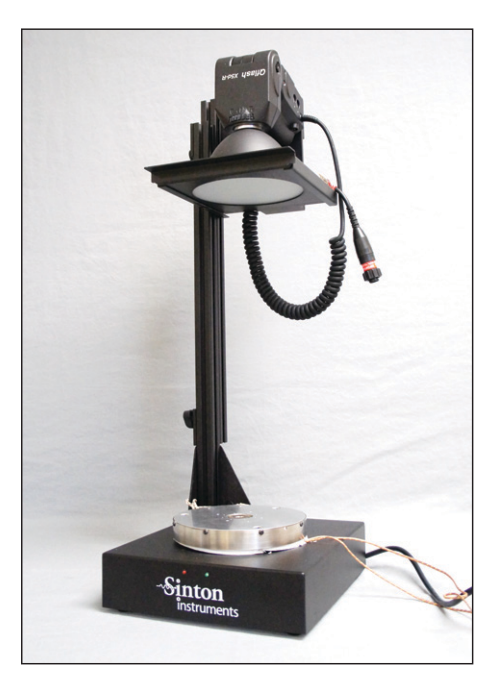
The WCT-120TS is an affordable, tabletop silicon lifetime and wafer metrology system.

Wafer measurement instrument offering calibrated analysis of temperature-dependent carrier-recombination lifetime.